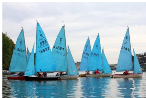
Enterprises at the 2010 Regatta

This may be needed sooner than you think, as with the backing of the sailing committee the pressure to have your buoyancy in date is not going to go away this year. There is nothing more embarrassing to a class captain, or a helm for that matter, than to see his boat half awash drifting down the river after a capsize in a summer squall.