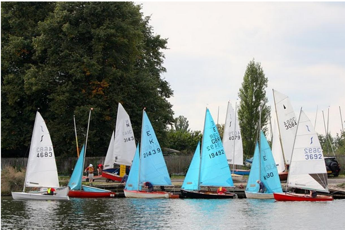
Middlesex Landing Stage, Regatta 2010