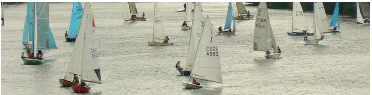
2010 Regatta Panorama