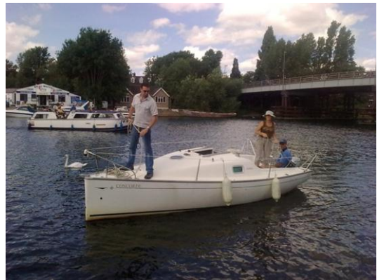
Concorde on the Thames

I had been mulling over the problem of how to manoeuvre Concorde into the dinghy park in my mind, but then the solution appeared in an advert in 'Practical Boat Owner' for front tow-bars from Watling Engineers, near St Albans. I checked out their website which includes a very impressive three minute video demonstrating how much easier it is to manoeuvre a trailer with a front tow bar rather than a conventional rear tow bar. I sent off for a tow bar and arranged for