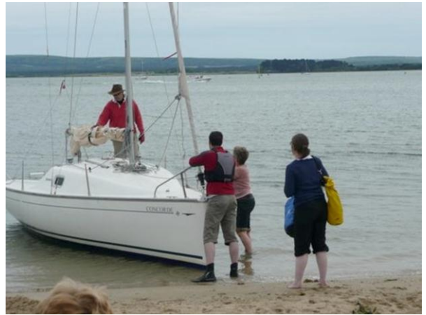
Concorde on the beach

Having ordered a replacement part to be delivered to a local mast rigger in Portland we took the boat down to Portland on the Tuesday and eventually got on the water on the Thursday having spent two nights sleeping on the boat parked in the National Sailing Academy car park!