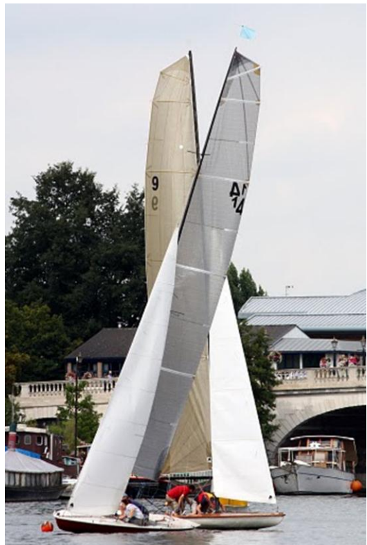
Raters at the 2010 Regatta (GM)