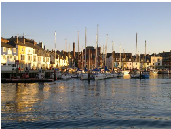
Evening in Weymouth

However, we did get some sailing in over the weekend. We had planned to meet up with Kevin and Susie in 'Temptress of Down' so instead of driving down with the boat we used our free weekend travel which comes with our (very expensive) SW Trains gold card season tickets to travel down to Weymouth. We had a very pleasant weekend cruising in Weymouth Bay with Kevin and Susie including a trip to Lulworth Cove and caught the train back on Sunday evening.